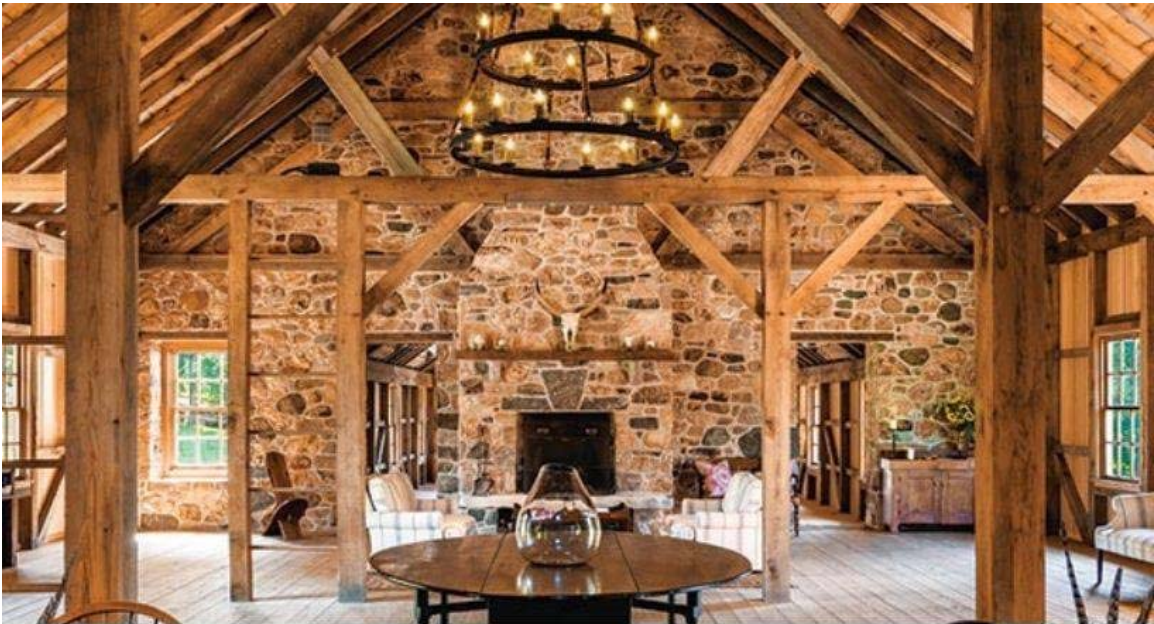
The stunning Abbott Barn, West Chester, PA.

The Orpheus Club would like to extend their gratitude to the Abbott family for the generous use of their barn for this concert recording.