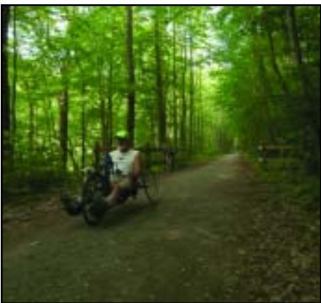
Hand and arm powered tricycles have become more and more popular.

cycles - hand and arm powered tricycles which come in either upright touring models or sleek, low riding performance bikes. For people who cannot use their legs to propel themselves, these bikes are a wonderful way to get out of a wheelchair and experience cycling.