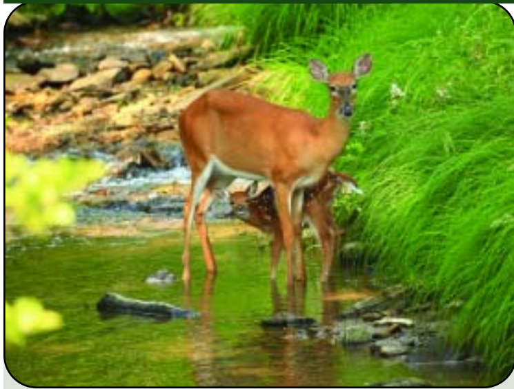
in Oil Creek State Park