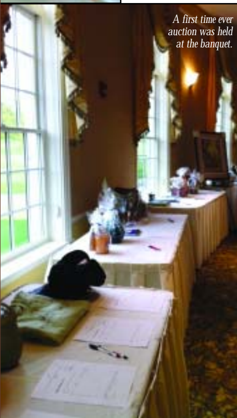
A first time ever auction was held at the banquet.

Piggy banks donated by M&T Bank were distributed to banquet attendees. All piggy bank proceeds will be given to the Leah Vogel Memorial Playground Fund, PPF's project to build playgrounds in each of the 56 state parks that needs one.