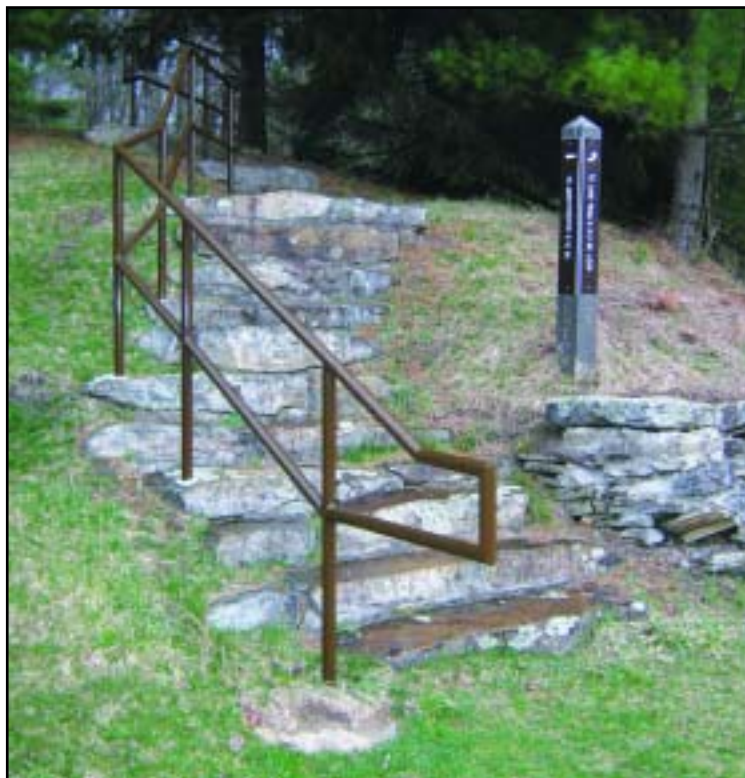
In 2012, the Friends of Black Moshannon purchased railing for the steps from the Environmental Learning Center to the campground.

The group is always looking for volunteers to help with event planning and volunteering at the actual events. "Specifically they are looking for a volunteer to aid them in developing a website," says Lavelua. If you are interested contact the park office at 814-342-5960 or blackmoshannonsp@pa.gov .