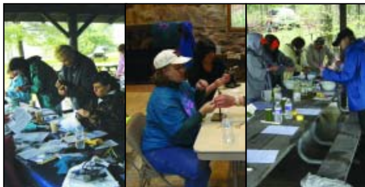
The Friends of Black Moshannon also run various community events throughout the year.