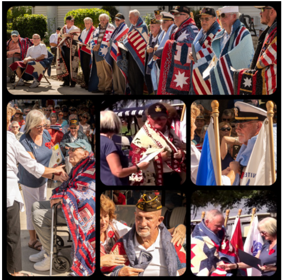
The first-ever QOV award ceremonies hosted by the new Carefree QOV Group were both memorable and multinational.

On November 11, 2019, Carefree celebrated its annual Veterans Remembrance Day Celebration. For the first time, a QOV awarding became an important part of this beloved and well-attended event. On that memorable day,