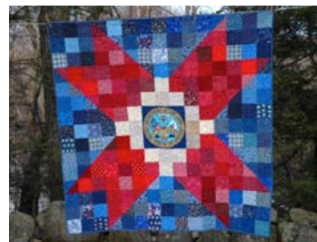
The Quilting Buddies of Connecticut and Rhode Island have completed the group’s 1,000th QOV this fall.

Over the years, quilters have come and gone from the group, but a core of original members remains. And this autumn, a milestone achievement for the group was reached. They completed their 1,000th QOV. Kudos to The Quilting Buddies and cheers to another 1,000 QOVs ahead!