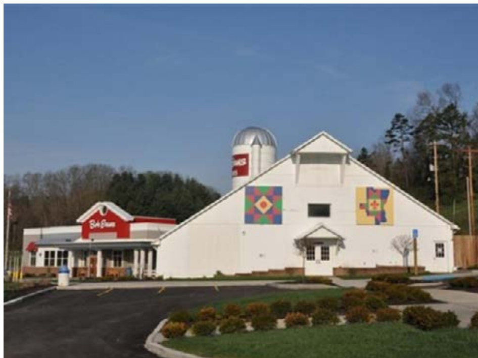
QOVs, the Old Glory Traveling Quilt Exhibit, and award ceremonies will be featured at joint effort of QOVF and Eyes of Freedom during the Bob Evans Farm Festival in Rio Grande, OH, October 12-14, 2018.