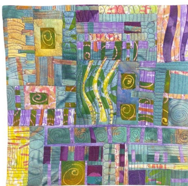
Lisa Walton - Spiral Fusion