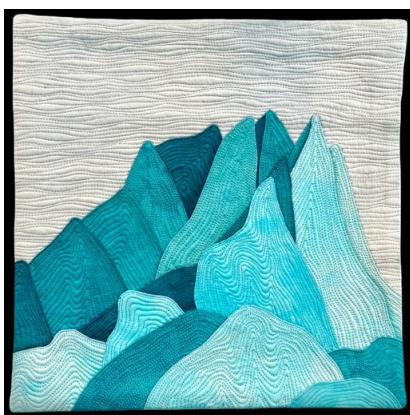
Fabienne Peter-Contesse - Glacier Series - Mini II

The 2021 auction will take place online from September 10 through October 3. With hundreds of beautiful artwork available for bidding, there is something for everyone to enjoy!