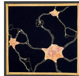
Carol Capozzoli Biophotonic Communication I