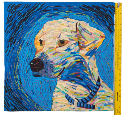
Learning how to make brushstrokes