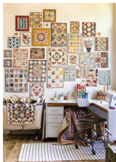
A studio view from Edyta Sitar from Laundry Basket Quilts.

https://masterpiecequilting.blogspot.com/2020/05/lets-be-real-studio-tour.html